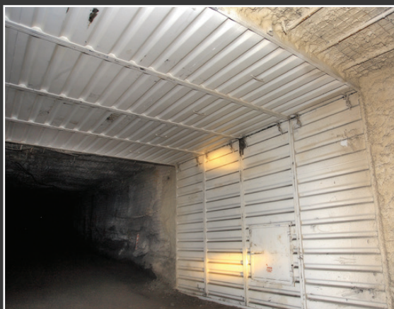
5 psi rated overcast

LARGEST RANGE OF LIVE TESTED, EXPLOSION RATED VENTILATION CONTROL DEVICES, TESTED AT WORLD RENOWNED FACILITIES.