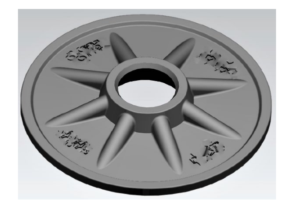
Figure 2 - GRRP Domed Plate